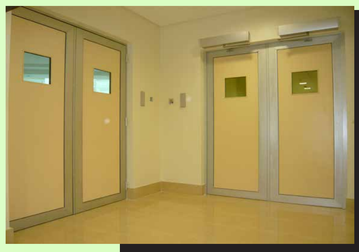
Automatic Swing Door