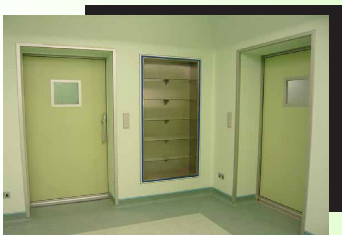
Various Color Schemes

Optional features: Automatic closing, elbow switch, push button, foot switch, radar, pull switch etc.